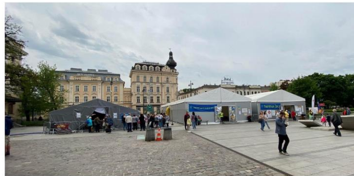
Temporary accommodation, kitchen and dining area, as well as clothes distribution point run by volunteers and charities in Krakow